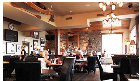
Dave's Pub & Grill Restaurant