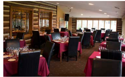
Oak Dining Room – Lakeside