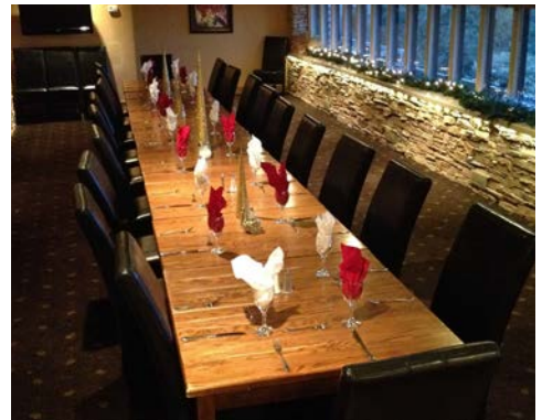
Oak Dining Room – Golfside