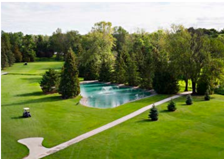
18 Hole Golf Course

Contact us today to schedule a tour and find out more about how to make your next group meeting an unforgettable success.