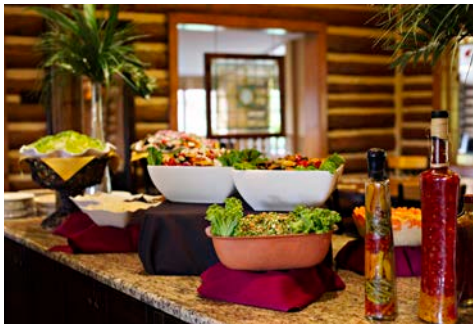
Buffet in the Oak Dining Room